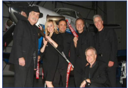
The New Life Band